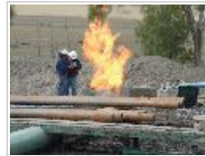
Gas flare from Bow CSG well

Click here to read the rest of today's news stories.