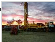
Drilling at Don Juan

The company said MHA Petroleum Consultants certified 34 petajoules of gross 2P reserves from the Juandah Coal Measures, up from the 192PJ of gross 3P (proved, probable and possible) reserves announced in March from the Juandah and Taroom coal measures.