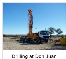
Drilling at Don Juan

The company said independent certifiers MHA Petroleum Consultants certified an additional 66.7PJ for the Taroom Coal Seams, adding to the earlier 34.2PJ certified for the Juandah Coal Seams.